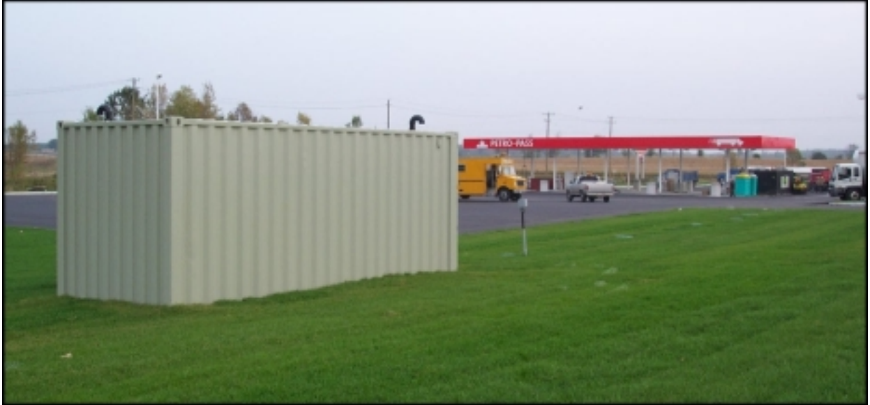
Figure 2. Waterloo Biofilter SC-20 shipping container at a truck stop, capable of treating 15-20 m 3 /day wastewater. Buried pump and septic tanks are in background.

The grease traps collect kitchen wastewater and discharge to the septic tanks, whereas the toilet and other wastewater discharges directly into the septic tank. Effluent filters on the grease traps are commercially sized Zabel filters, and have an access riser to surface for regular servicing. Septic tanks are set in series and are preferably double-compartment tanks, again with risers to surface to service the effluent filters.