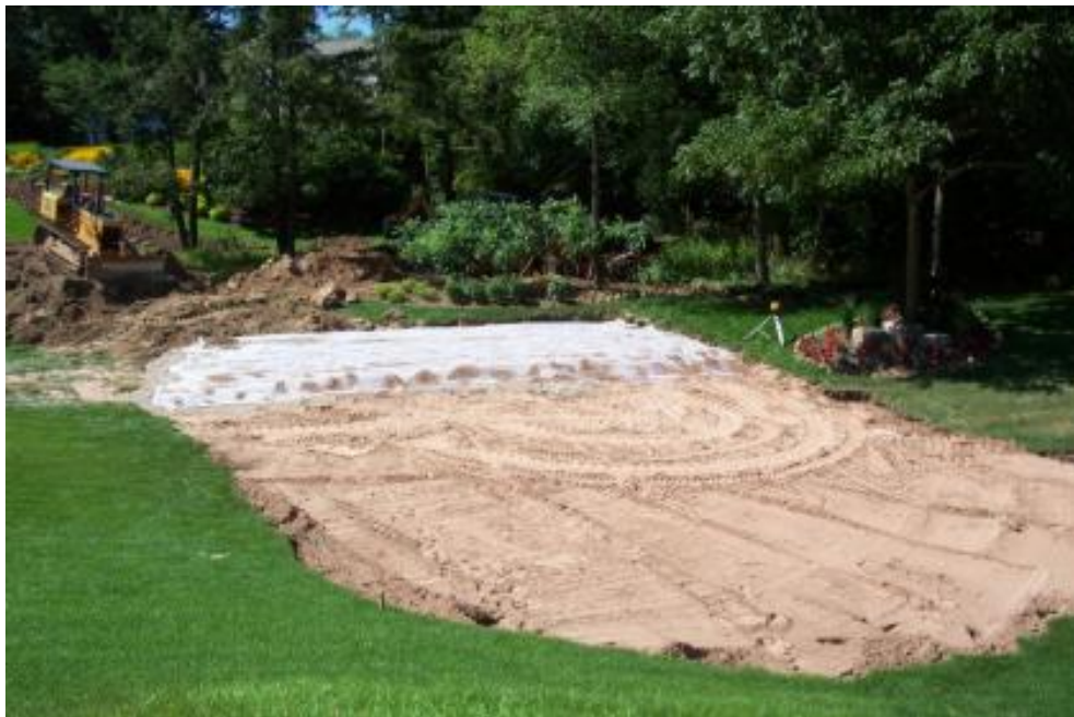
Figure 3. Example of ‘Shallow Area Bed’ for treated effluent in stone-pipe area in background, infiltrating into the sand and native soil mantle in the foreground.

The preferred method of disposal of treated effluent in all types of soils is the ‘Shallow Area Bed’ (Fig. 3). The beds are constructed with a 250-300 mm thick contact bed of clear medium-fine sand (<5% silt) set ~25 cm deep into the native soil. This sand size (percolation of 6 < T < 10 min/cm or about 1.3e^{-3} to 1.3e^{-4} cm/sec) is fine enough to allow lateral movement and removal of pathogens, but coarse enough not to plug up with the clear biomat that forms even with highly treated effluent.